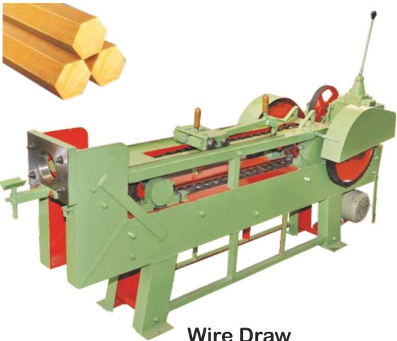
Wire Draw Machine (Light, Medium, Heavy)