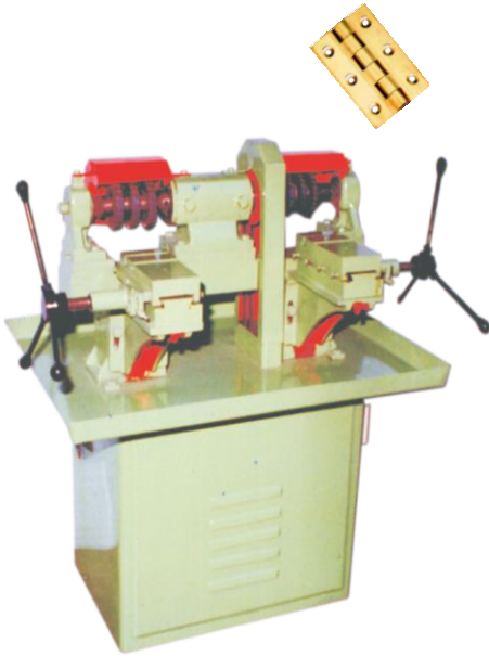
Hinges Slot Machine