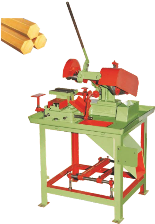
Rod & Section Cutting Machine