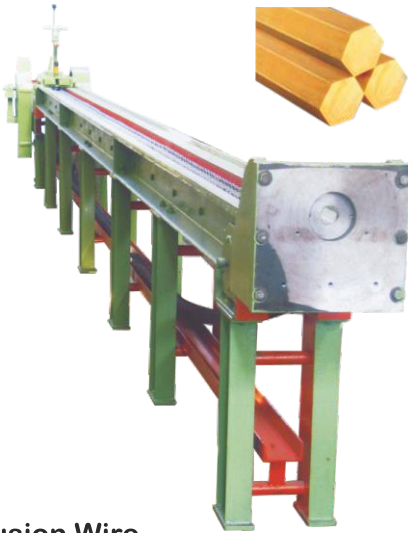
Extrusion Wire Draw Machine Rod Dia. Cap. 10 mm 70 mm